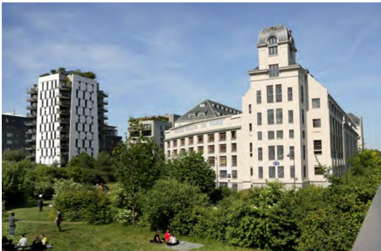
The Jardin de l'Abbé Pierre located on the Grands Moulins campus in the 13 th district