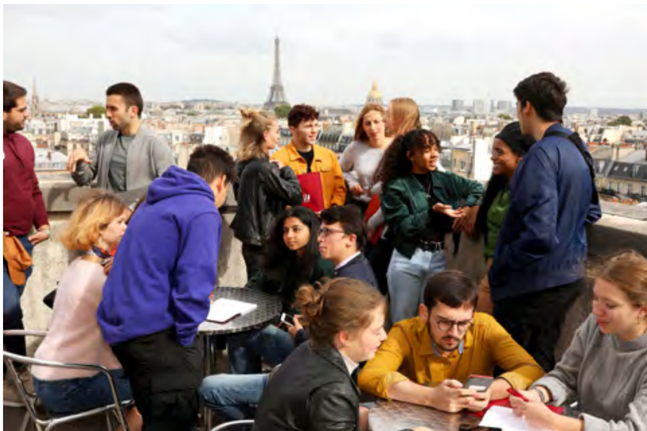
Université Paris Cité has over 500 000 m 2 of campus grounds within Paris and its surrounding areas