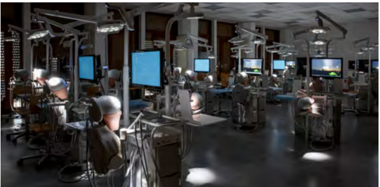
Plateforme de simulation en odontologie.