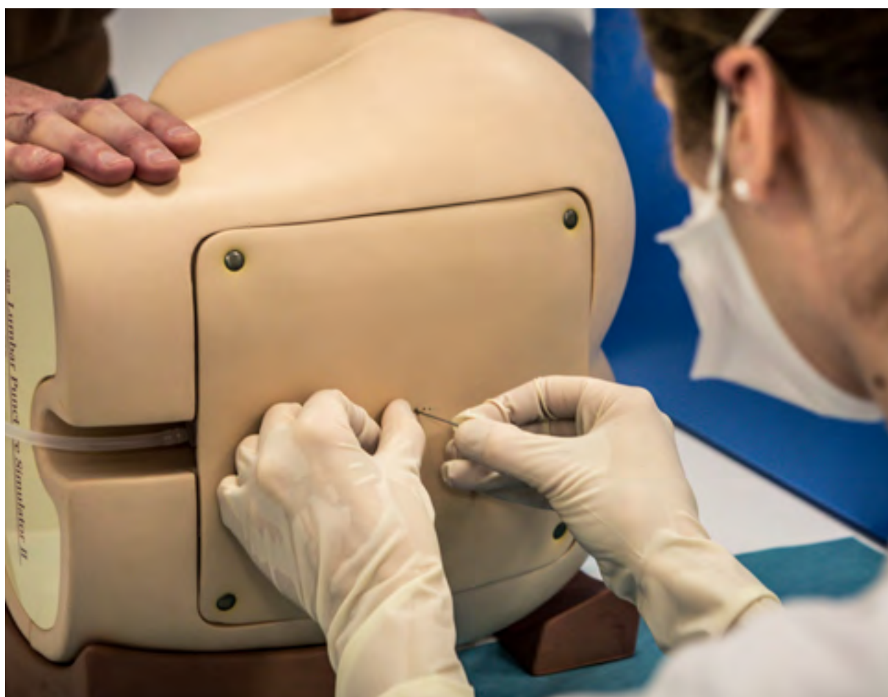
iLumens healthcare simulation, an innovative pedagogical platform associated with numerous partners

Developing the management tools, information systems and monitoring tools to make it easier to monitor students and support their success: systematically setting up learning contracts, monitoring statistics for student success, monitoring their ongoing education and professional integration, and continuing to roll out the e-portfolio currently put in place for health students.