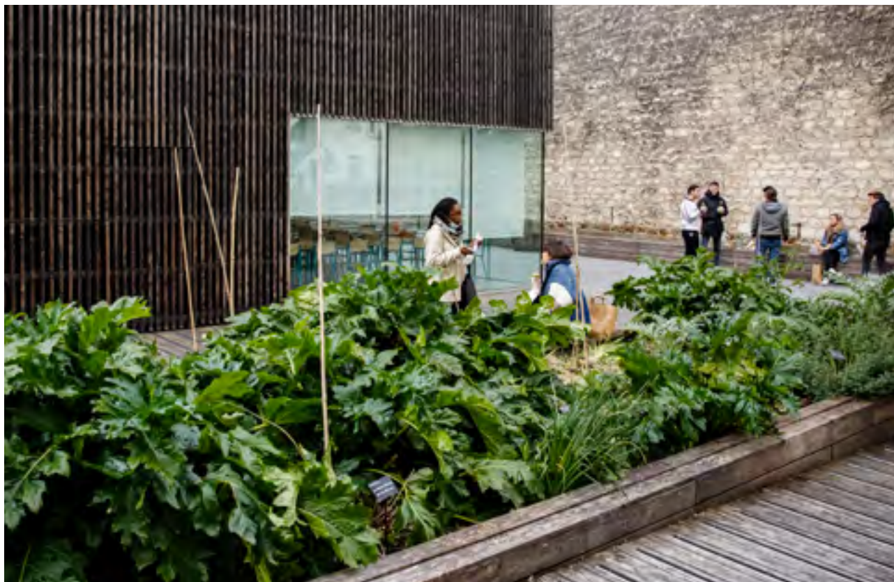
Community garden project called «Retour de la Terre», created by artist, landscape architect Emmanuelle Bouffé on the IUT campus Paris Rives de Seine

Université Paris Cité aims to contribute to its region's growing influence and reputation by capitalising on links with other academic, scientific, technological and cultural institutions. We are therefore putting in place an action plan to expand and reinforce our contacts with these institutions located in Paris and the Paris Region, but we will also be drawing on our international partners - for example, within Circle U, where one of the actions is focused specifically on entrepreneurship, including women, interacting with the city and our health stakeholders.