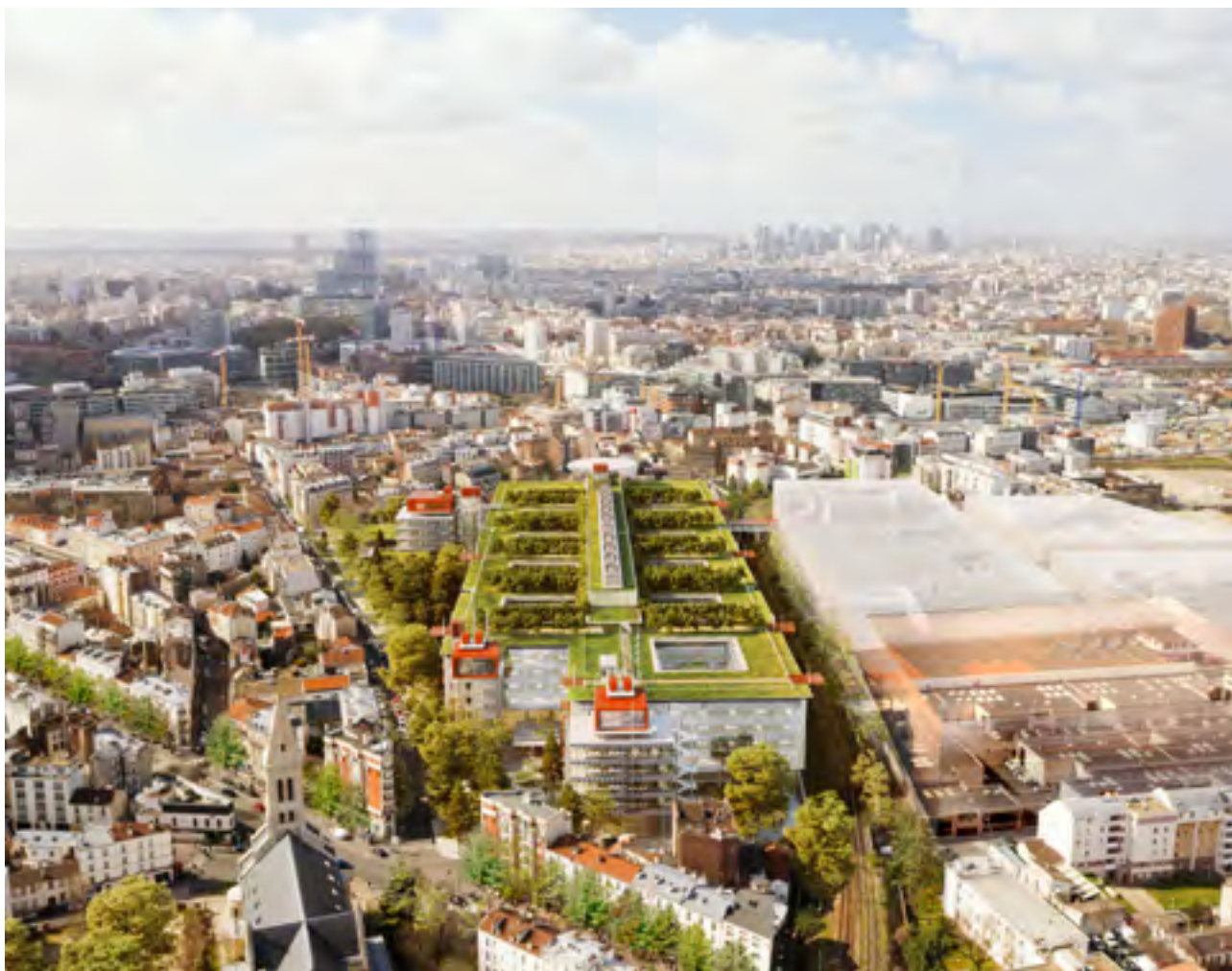
The Saint Ouen university-hospital campus project opening in 2028