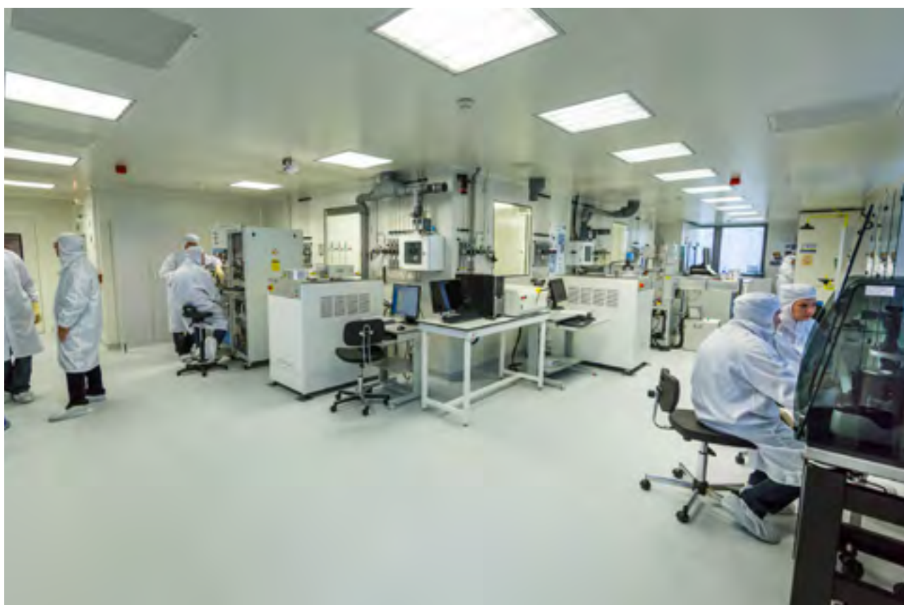
Supporting scientific platforms and equipment is a priority. The white room: Faculty of Science - Physics Department

Lastly, we will develop initiatives supporting open science on the one hand (by deploying the infrastructures that enable research results and data to be published, as well as supporting scientific mediation and participatory science initiatives), while promoting scientific integrity and ethics on the other hand.